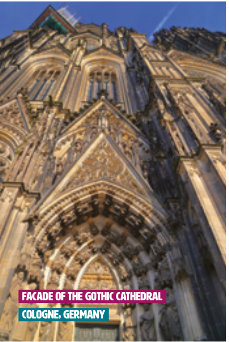
FACADE OF THE GOTHIC CATHEDRAL COLOGNE, GERMANY