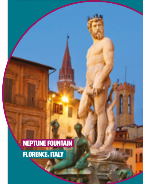
NEPTUNE FOUNTAIN FLORENCE, ITALY

Contact us for full terms and conditions